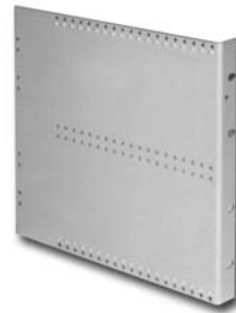
Universal With EIA Flange & Universal Hole Spacing (.12mm)