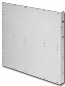
With EIA Flange